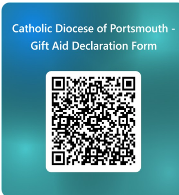
Catholic Diocese of Portsmouth - Gift Aid Declaration Form

Thank you to all who support the parish through planned giving and online donations. If you are a UK taxpayer and you register for Gift Aid, the government gives the parish an extra 25% on top of what you have given, at no extra cost to you. We need to update our files so you may get an email from us soon to re-register Gift Aid. Please take the time to fill this in so we can continue to claim. If you are not a Gift Aider please consider it. You can also use the QR Code here to register.